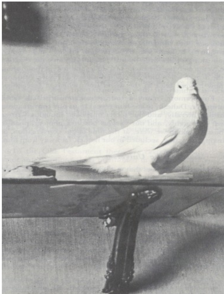
The Dove of Noah